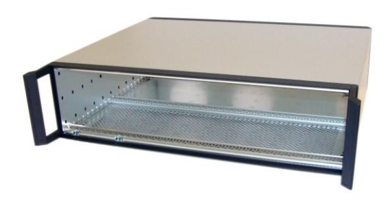
pic. 3: casing design 19"rack mount version