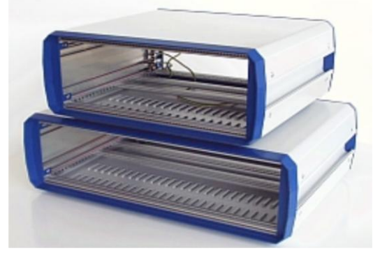
pic. 4: table top casings 63TE and 84TE