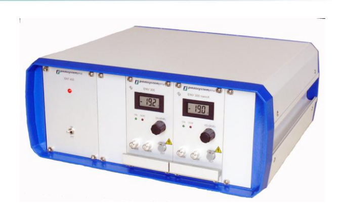
pic. 1: ENV system based on 63TE table top casing